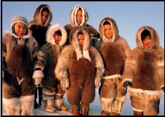
THEY WERE NO LONGER ALONE.